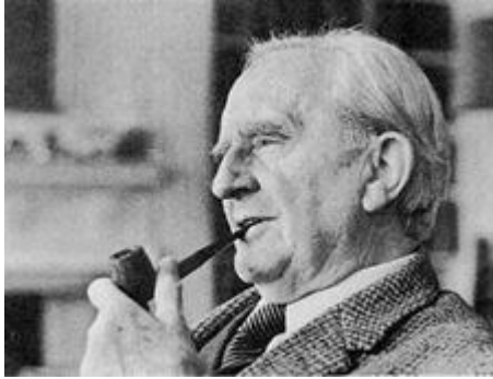
Tolkien in 1972