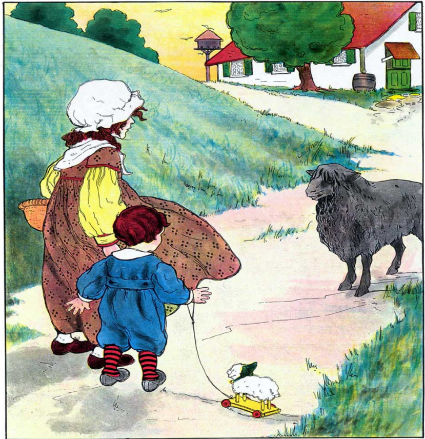
BAA, BAA, BLACK SHEEP