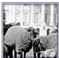
Sheep on the White House lawn

In 1917, President Woodrow Wilson sent American troops to fight in World War I. He said that the world must "be made safe for democracy." In a democracy, all the people decide who will have power. Wilson wanted to make sure that if a country wanted to be a democracy, another nation would not stop them.