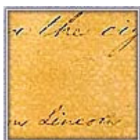
Lincoln's signature on the Emancipation Proclamation

One of the most important jobs of a president is to write and sign his name on papers, called documents. One of the most important documents ever written by a president is called the Emancipation Proclamation. It was signed by President Abraham Lincoln in his White House office on January 1, 1863. Emancipation means being free. Proclamation is a way of telling people something. Abraham Lincoln was telling people that the slaves were free. He wrote the paper and signed it during the Civil War.