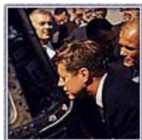
President Kennedy and astronaut John Glenn, 1962

Good leaders set good examples. President Wilson thought he should set an example, so he planted a vegetable garden at the White House. Instead of buying vegetables, the Wilson family ate what they grew in the White House garden. President Wilson also had sheep in his yard! The sheep's wool was sold and the money was used to help pay for army hospitals. President Wilson showed Americans that they should sacrifice, too.