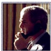
President Bush at work

Since so much power is given to one person, we hope that the president is a good leader. We hope that he uses his power to make the lives of Americans better.