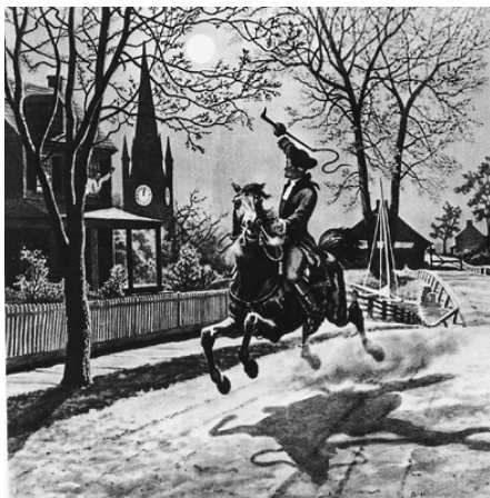
Paul Revere's ride.