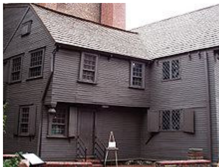
Paul Revere's house in Boston.

In his poem, Longfellow took many liberties with the events of the evening, most especially giving sole credit to Revere for the collective achievements of the three riders (as well as the other riders whose names do not survive to history).