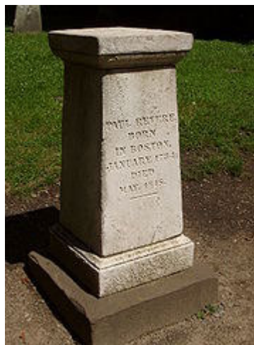
Paul Revere grave site in Granary Burying Ground