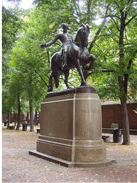
This Paul Revere Statue in North End, Boston was made by Cyrus Dallin and unveiled on September 22, 1940